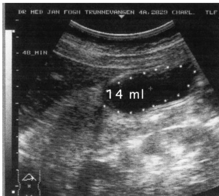
Figure 1 Ultrasound scan with computer-generated ellipsoid superimposed.

projection was an oblique upward view with the transducer positioned under the left curvature allowing the gastric fundus, body and antrum to be inspected, and the second was a transverse view across the epigastrium with a slight upward direction viewing the antrum, pylorus and the duodenal bulb. The two projections ensured very clear visual estimation of the volume (see Fig. 1). All examinations were recorded on videotape and still pictures were taken every 5 min.